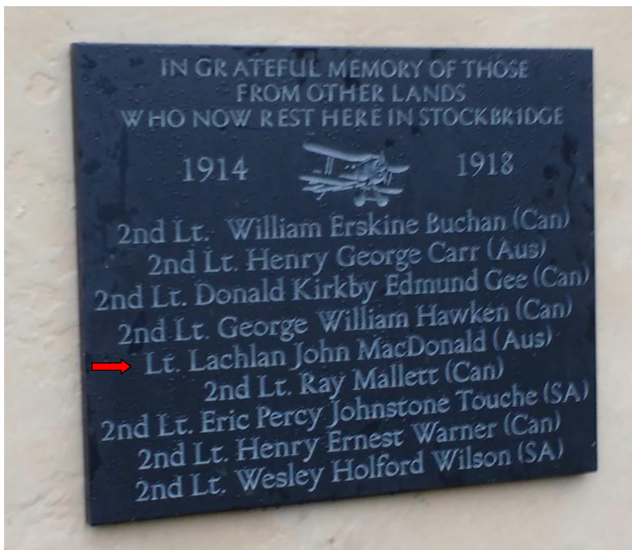
Memorial Plaque to 9 Commonwealth Airmen at Old St Peter's Church, Stockbridge, Hampshire

(The Parish Magazine for Stockbridge, Longstock & Leckford – April, 2018)