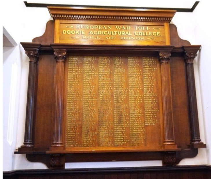
Dookie Agricultural College Roll of Honour