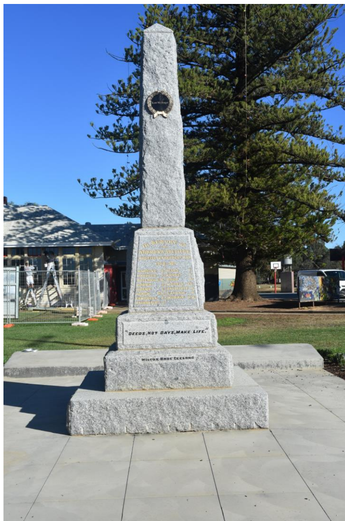
Ardmona War Memorial