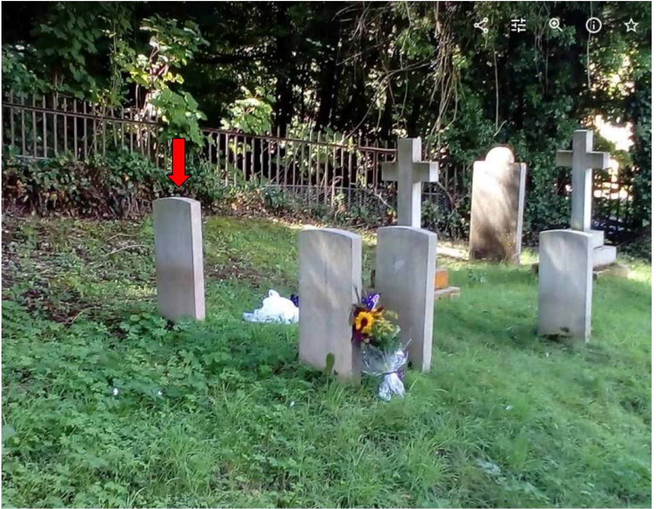
Second Lieutenant MacDonald's headstone marked with red arrow