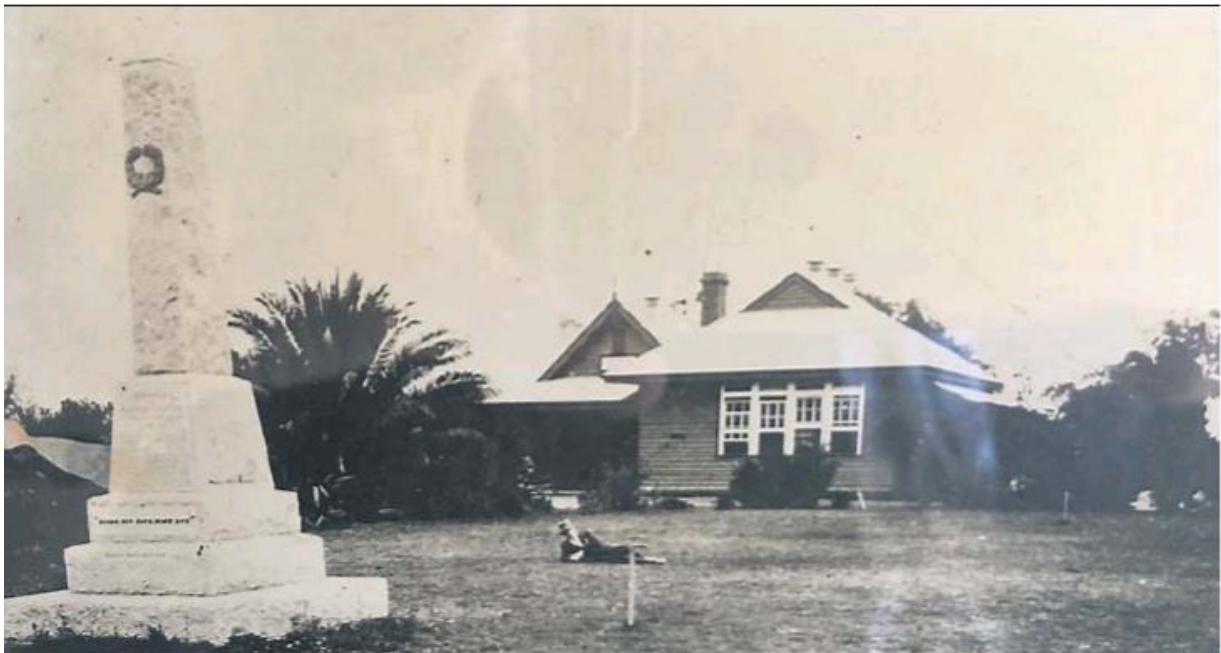
Historic: Old photo of the Ardmona World War I memorial with laurel still intact.