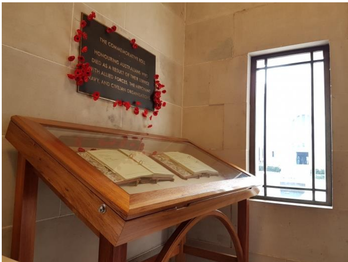
Commemorative Roll