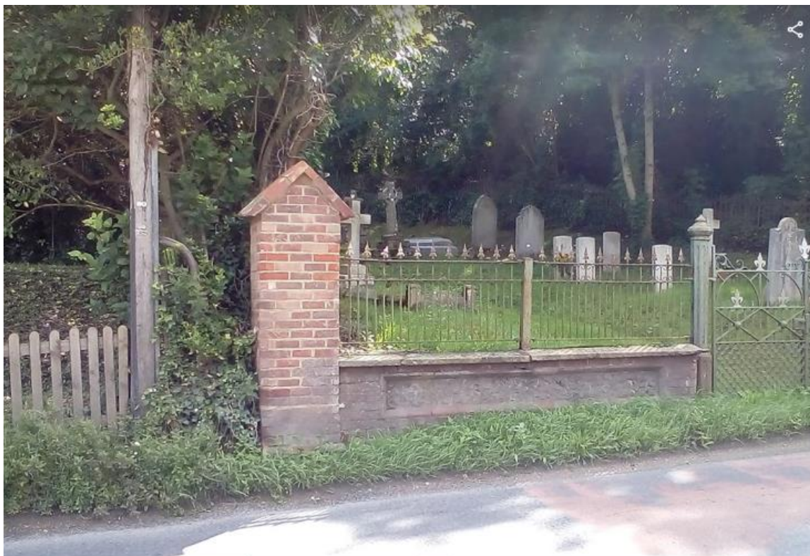
Stockbridge Cemetery, Hampshire

Stockbridge Cemetery, Hampshire has 10 Commonwealth War Graves – all Air Force burials from World War 1 with 2 Australians.