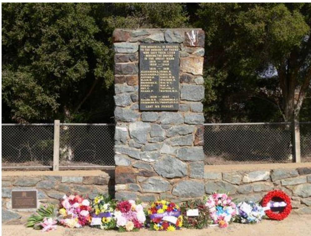
Dookie Cenotaph